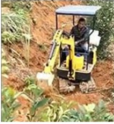
Digging a trench in the orchard