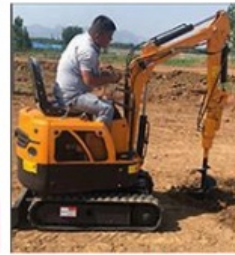
Rotary drill pits