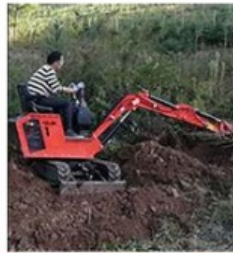
Mountain forest reclamation