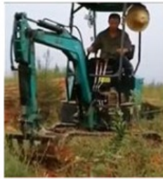
Wasteland cultivation of grass