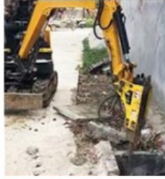
Crushing and demolition