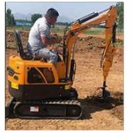
Rotary drill pits