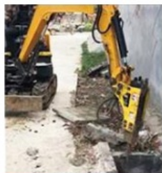
Crushing and demolition