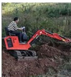
Mountain forest reclamation