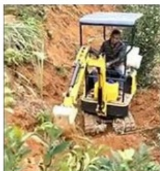
Digging a trench in the orchard