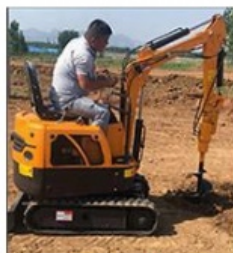
Rotary drill pits