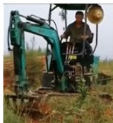
Wasteland cultivation of grass