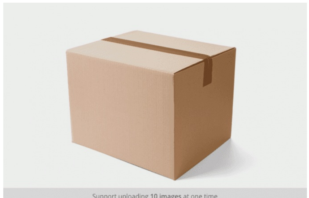
Support uploading 10 images at one time